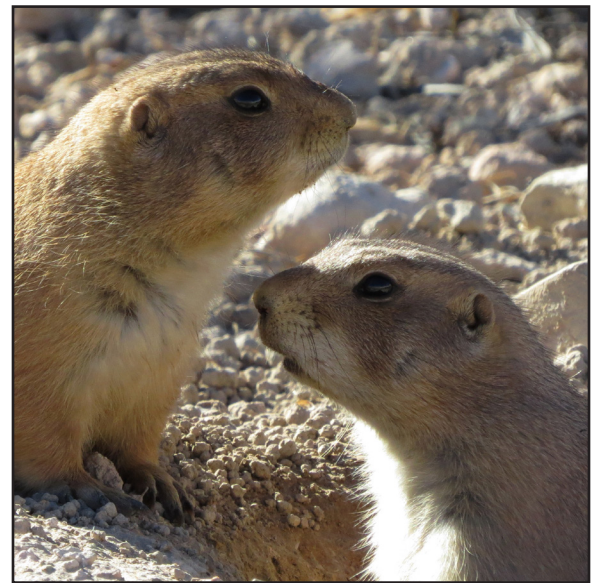
Prairie Dogs at Living Desert