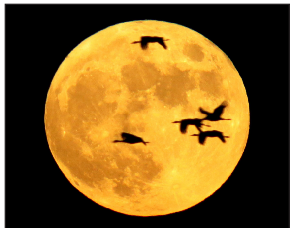
Sandhill Cranes at sunset