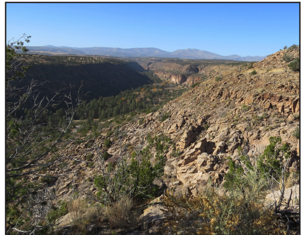
Bandelier National Monument