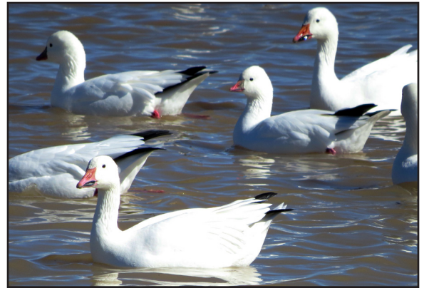
Snow Geese and a Ross's Goose